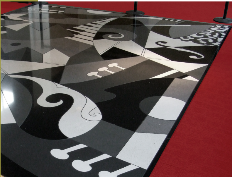
"Energy of The Arts ~ Bohemian Sophistication" Quartz Stone Carpet, Main Lobby, UDC Auditorium